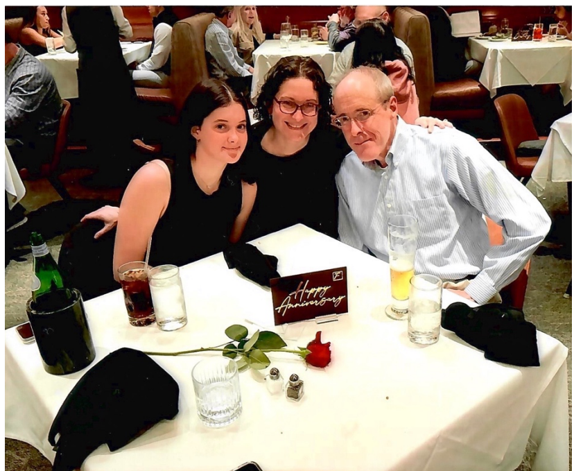
My Family (May 2026)

Today my days are filled with a lot less noise and a lot more calm. Today my purpose isn't me. Today my purpose is others. I no longer put on a suit and tie, and chase after the next promotion or paycheck. Today my focus is my daughter; my wife; my sweet dog, Abbey; and our home.